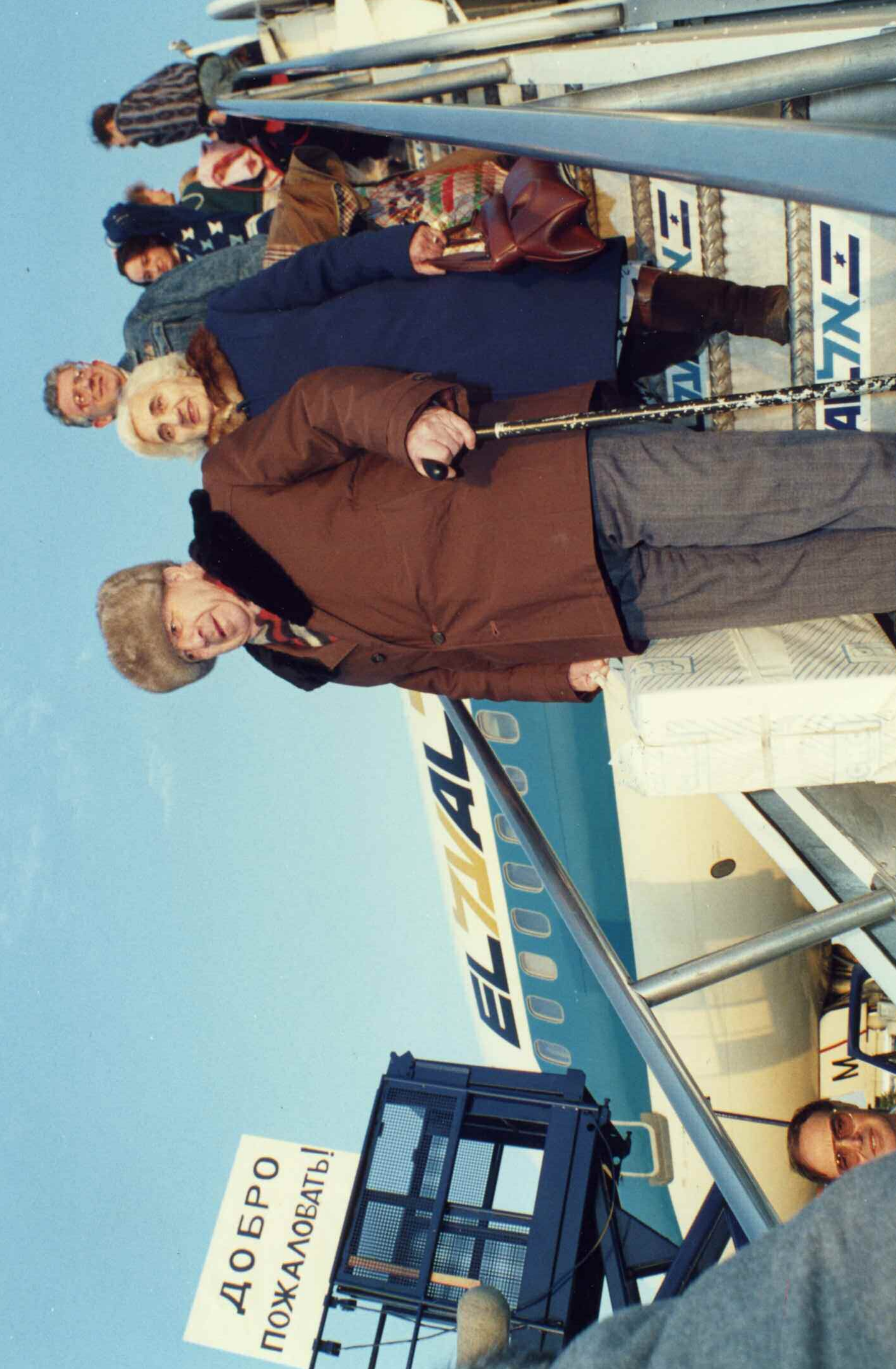
Arrival in Israel of Jewish immigrants from the Soviet Union on the first EL AL charter flight from Moscow as part of Operation Exodus, January 1, 1990.

The sign (in Curillic) welcomes the new arrivals.