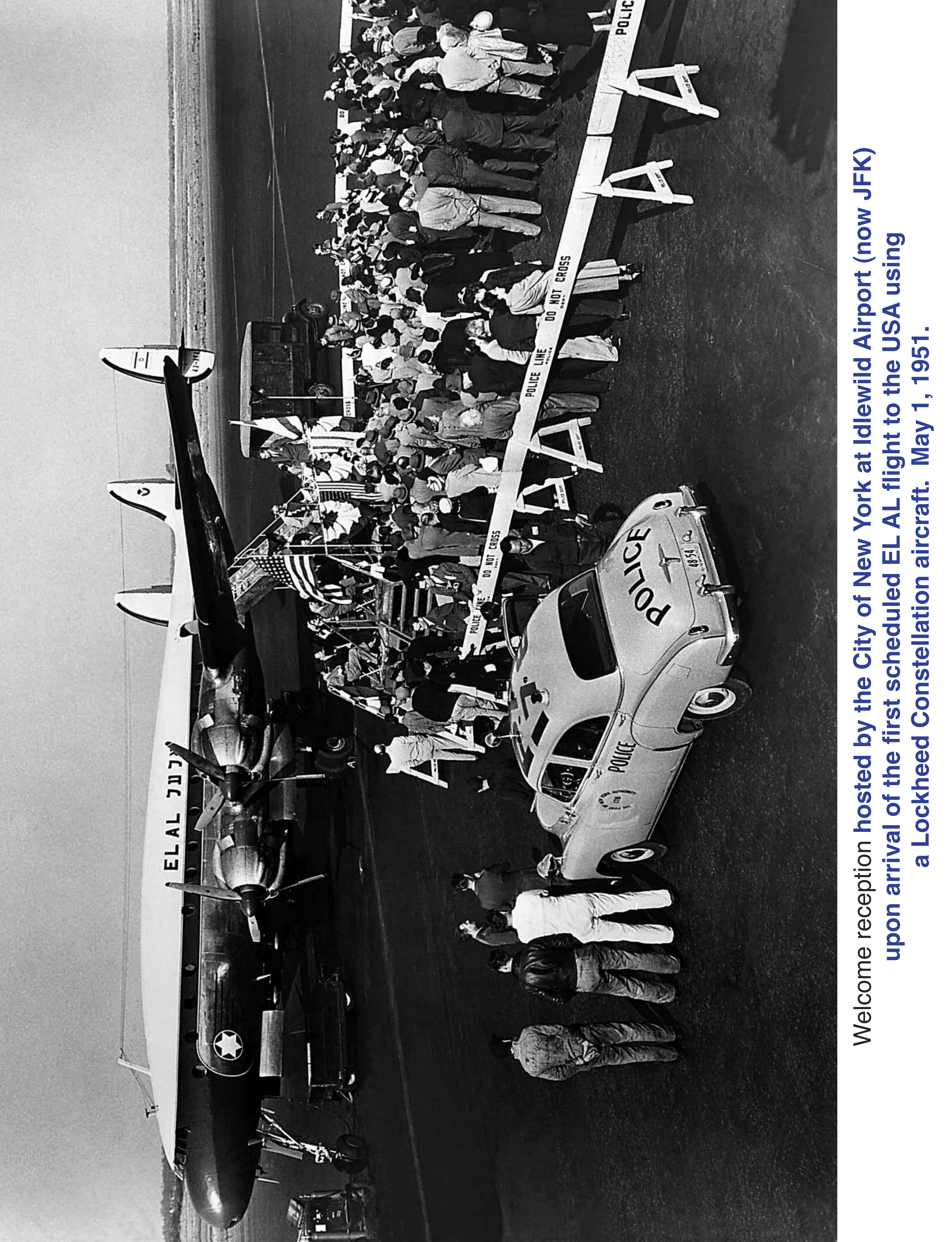
Welcome reception hosted by the City of New York at Idlewild Airport (now JFK) upon arrival of the first scheduled EL AL flight to the USA using a Lockheed Constellation aircraft. May 1, 1951.