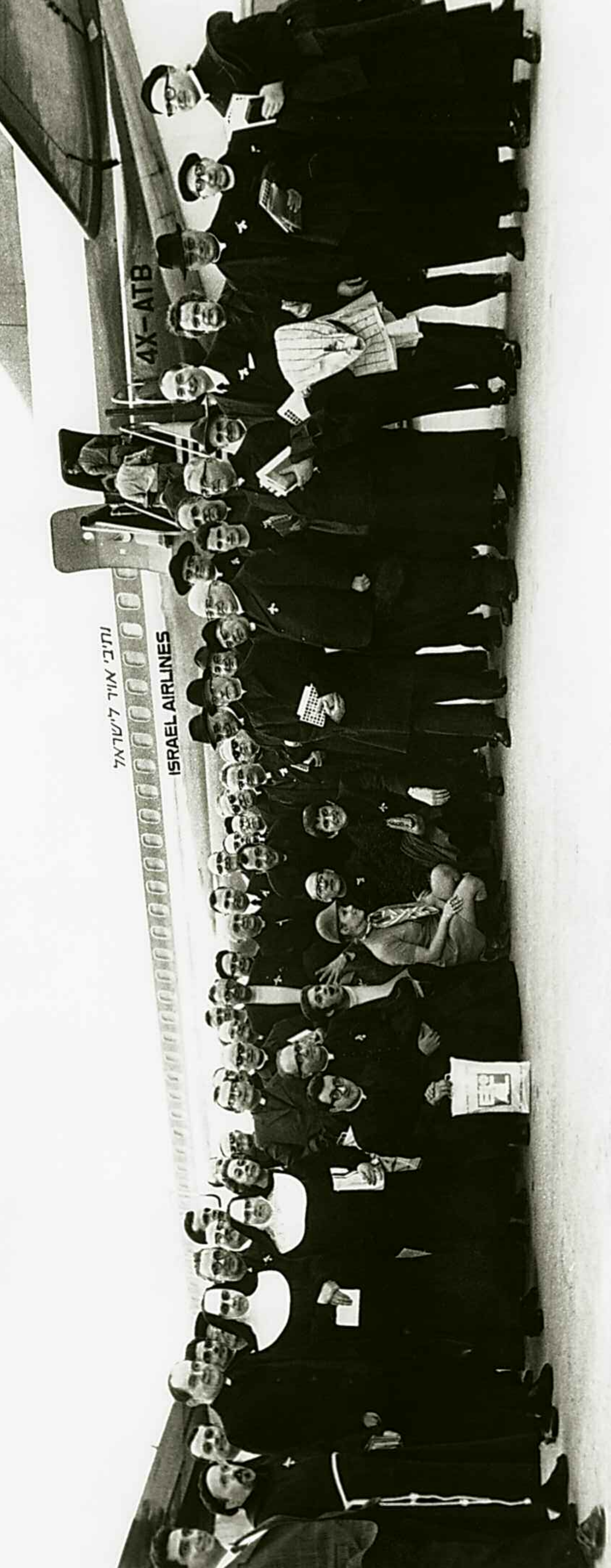
Israel is a popular destination for Christians making a pilgrimage to the Holy Land. Shown is a group of Christian clergy from Europe upon arrival at Lod (Ben Gurion) Airport, in the late 1960s.