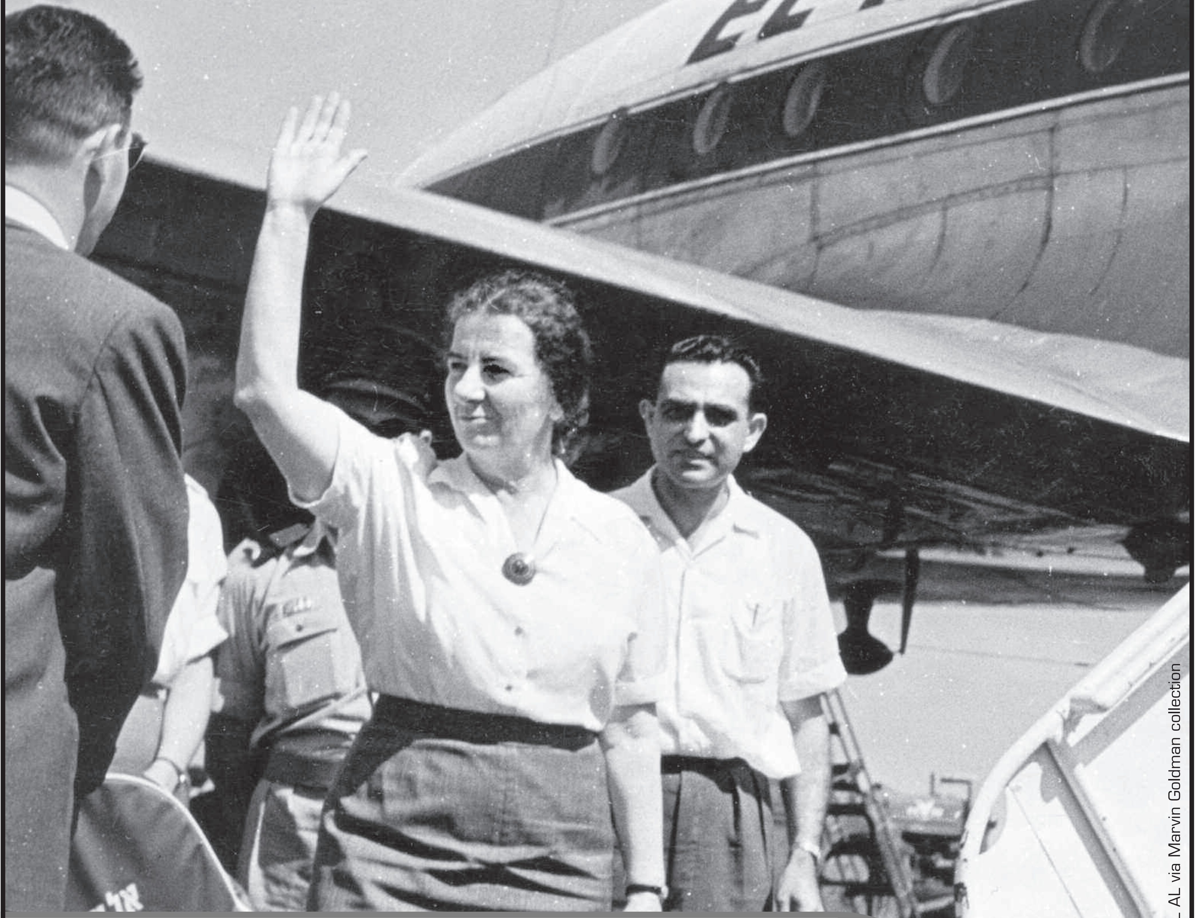
EL AL via Marvin Goldman collection