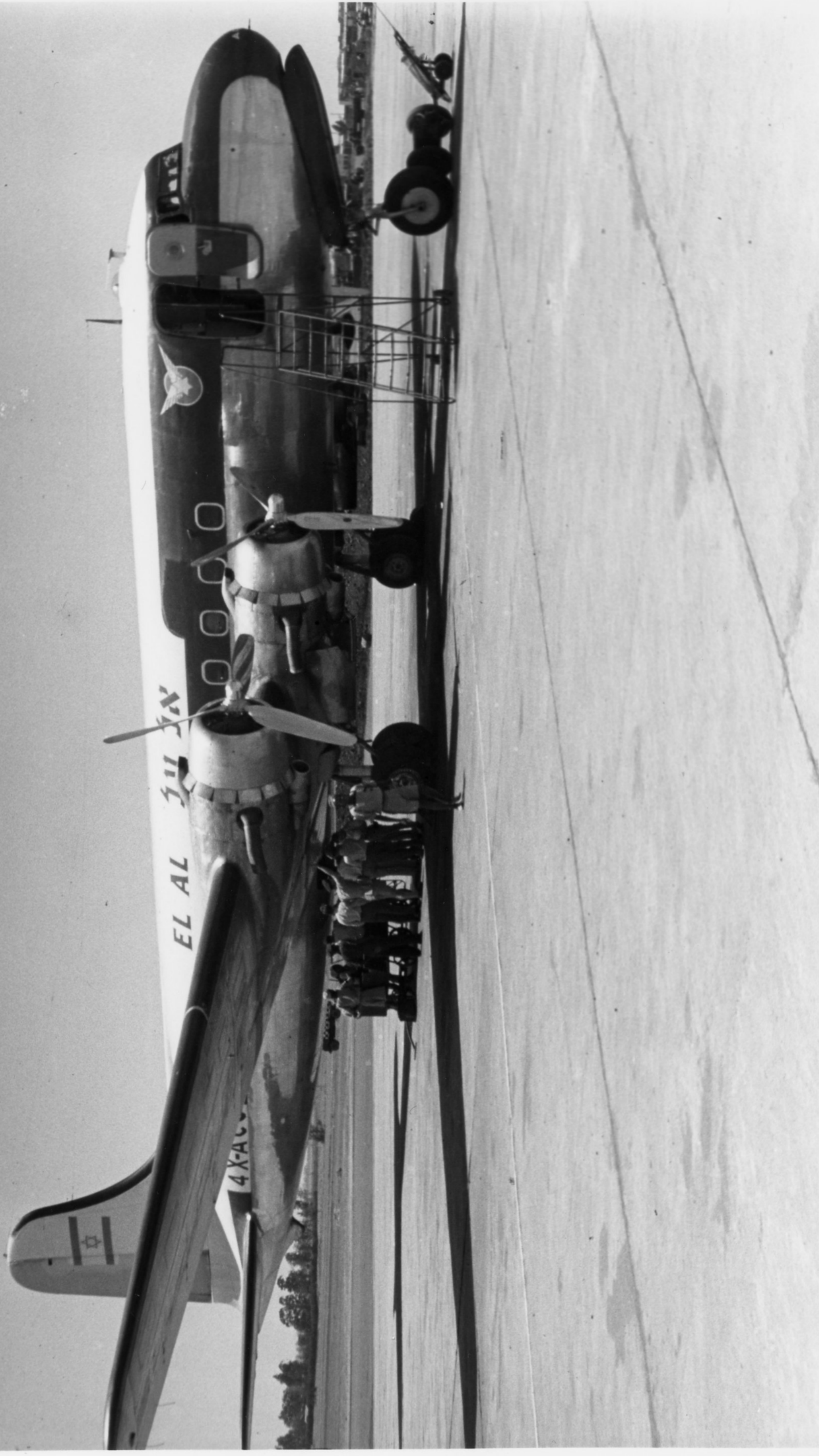
The first EL AL purchased aircraft, a Douglas DC-4, Israeli registration 4X-ACC, acquired in March of 1949.