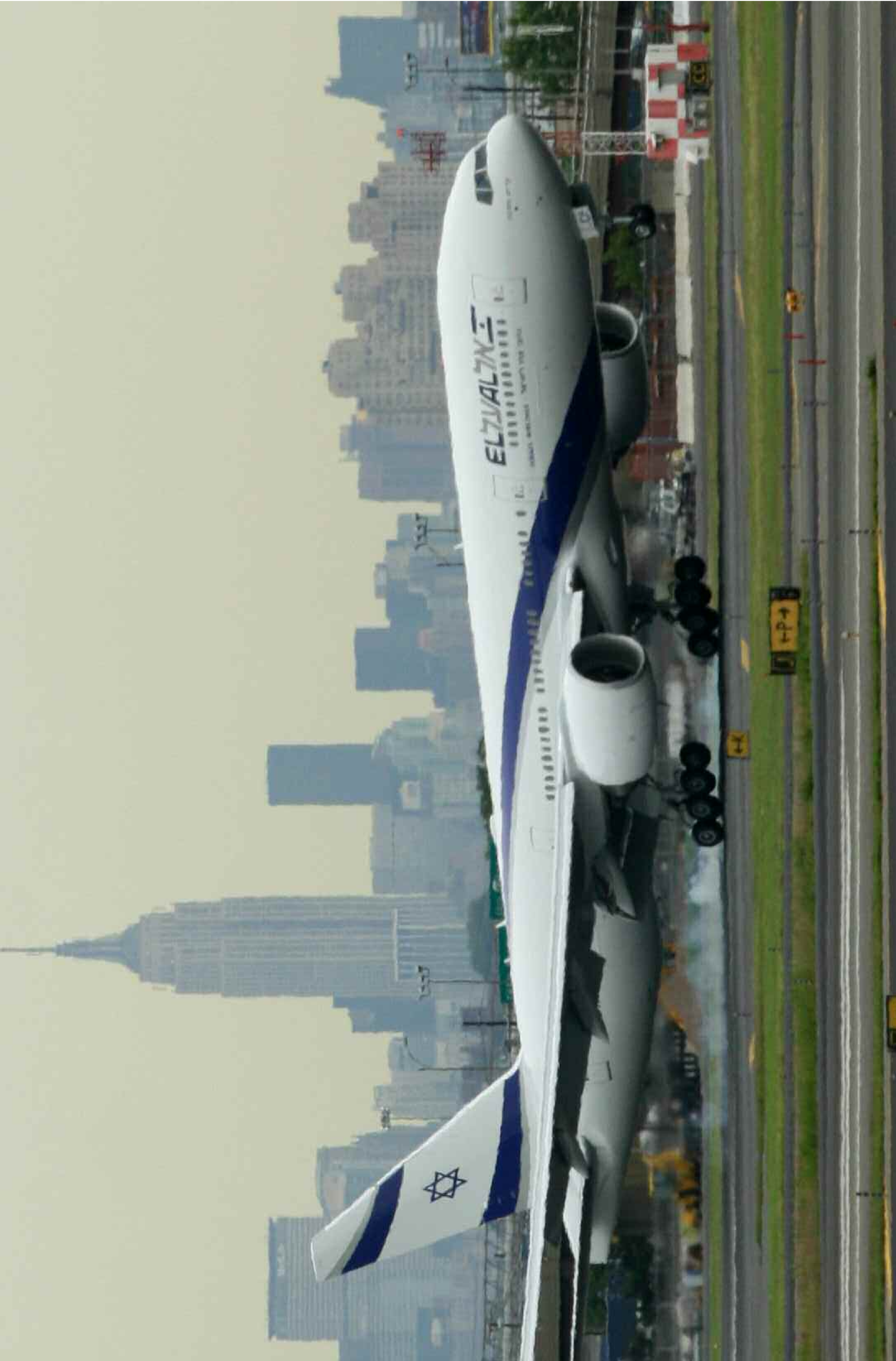
The new EL AL Boeing 777 aircraft named Kiryat Shmona, an Israeli border city in the north, landing at Newark Liberty International Airport in 2007 with New York's Manhattan skyline in the background.