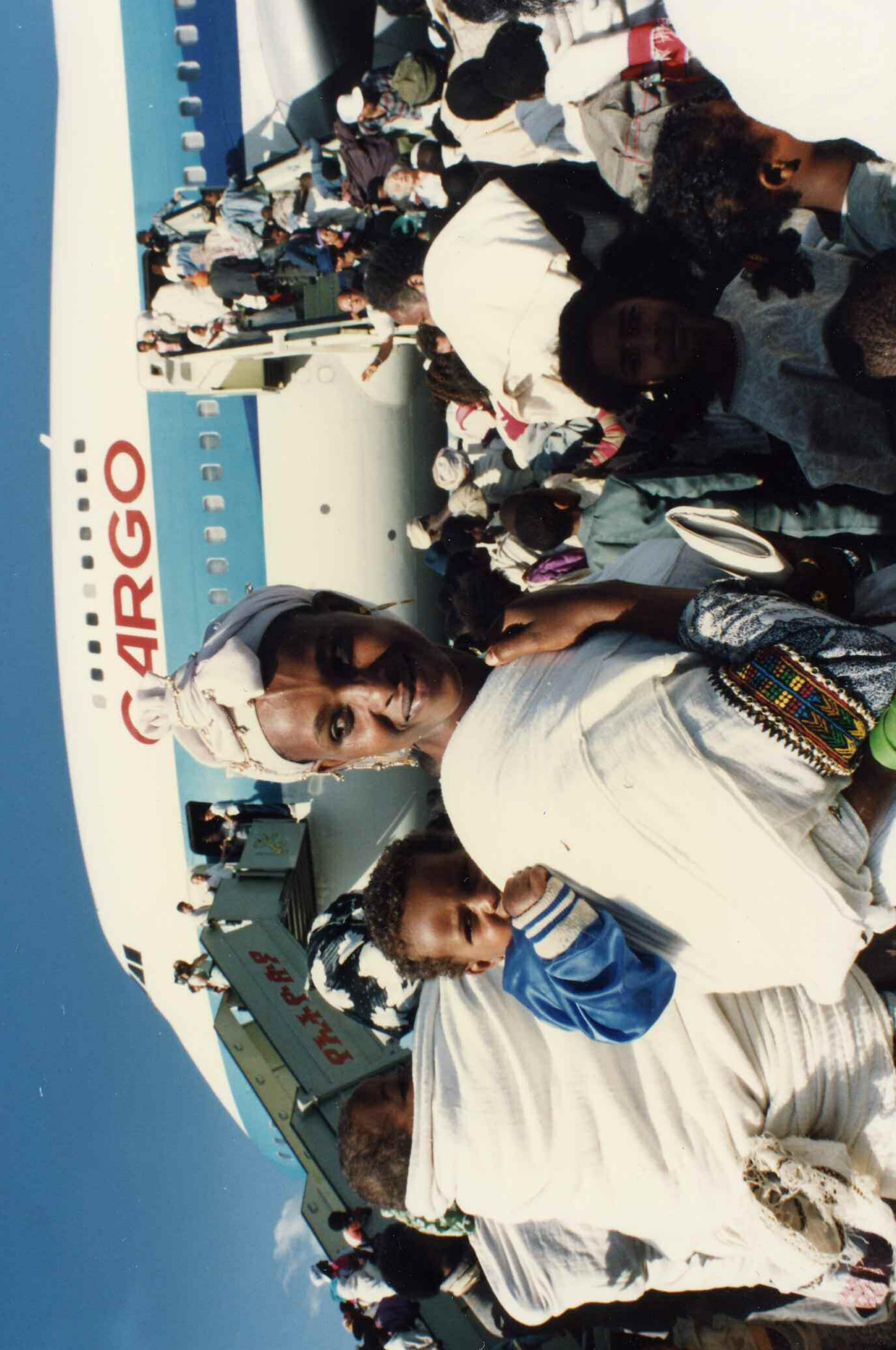
...Boarding an EL AL 747 aircraft in Addis Ababa, Ethiopia during the Operation Solomon airlift on May 24, 1991 in which 14,000 Ethiopian Jews were rescued and brought to Israel. The aircraft shown carried 1,087 persons, an all-time record for the most passengers on any plane.