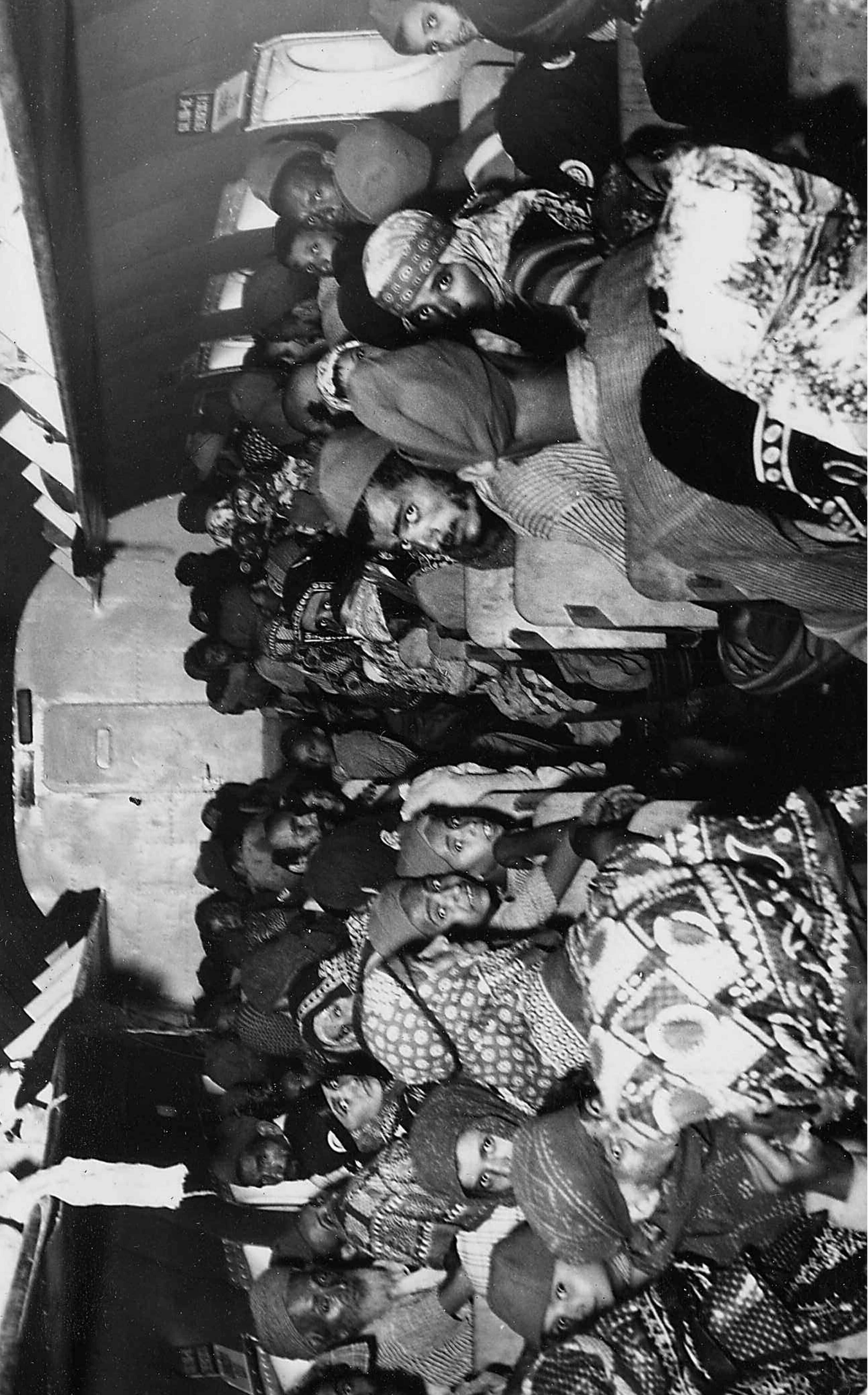
Yemenite airlift flight operated by an EL AL crew. Forty thousand Jews from Yemen were rescued in 1949 as part of Operation Magic Carpet on flights from Aden to Israel.