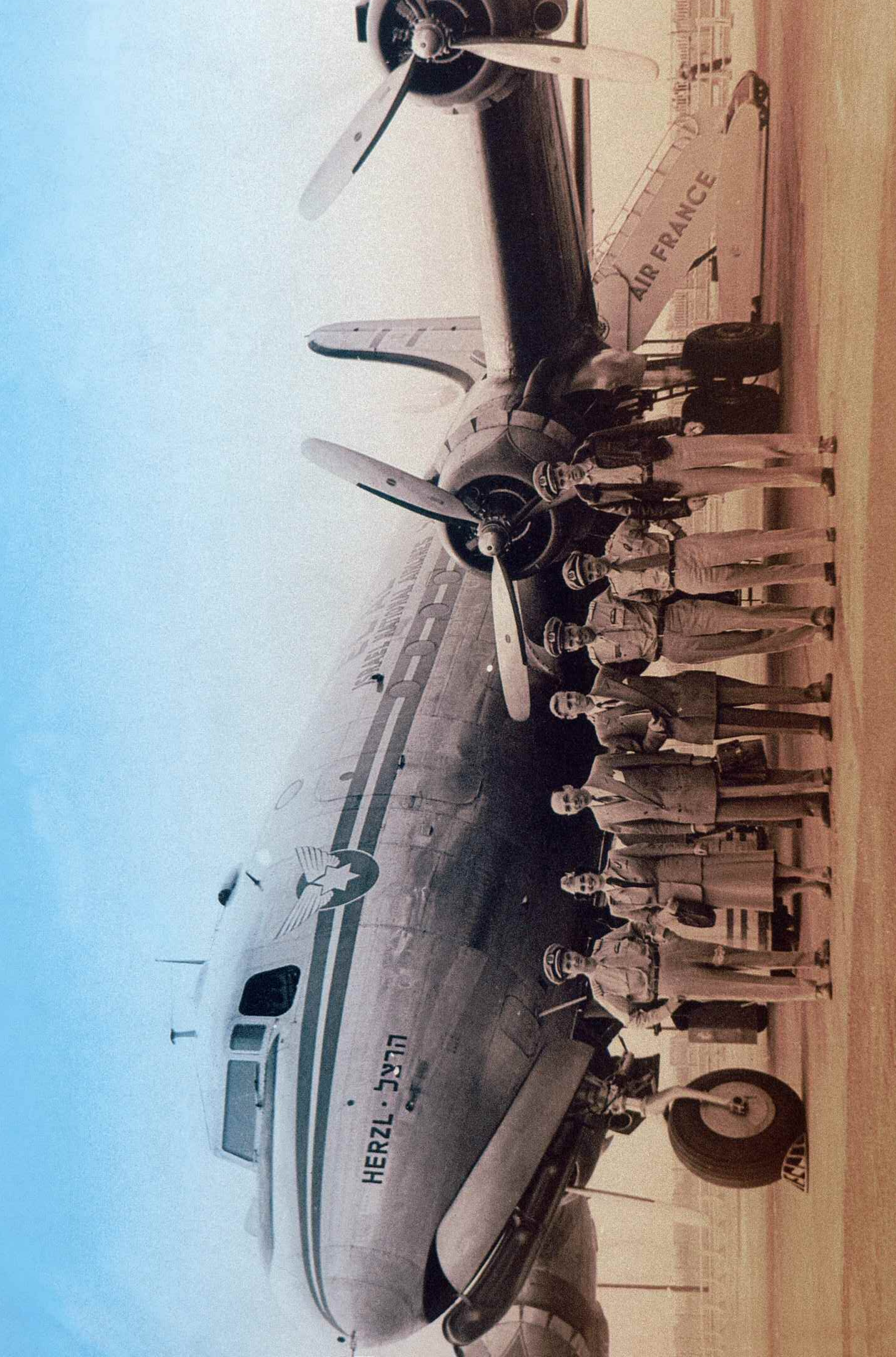
First EL AL scheduled passenger flight (July 31 – August 1, 1949) arrives at Orly Airport, Paris following a flight from Tel Aviv via Rome.