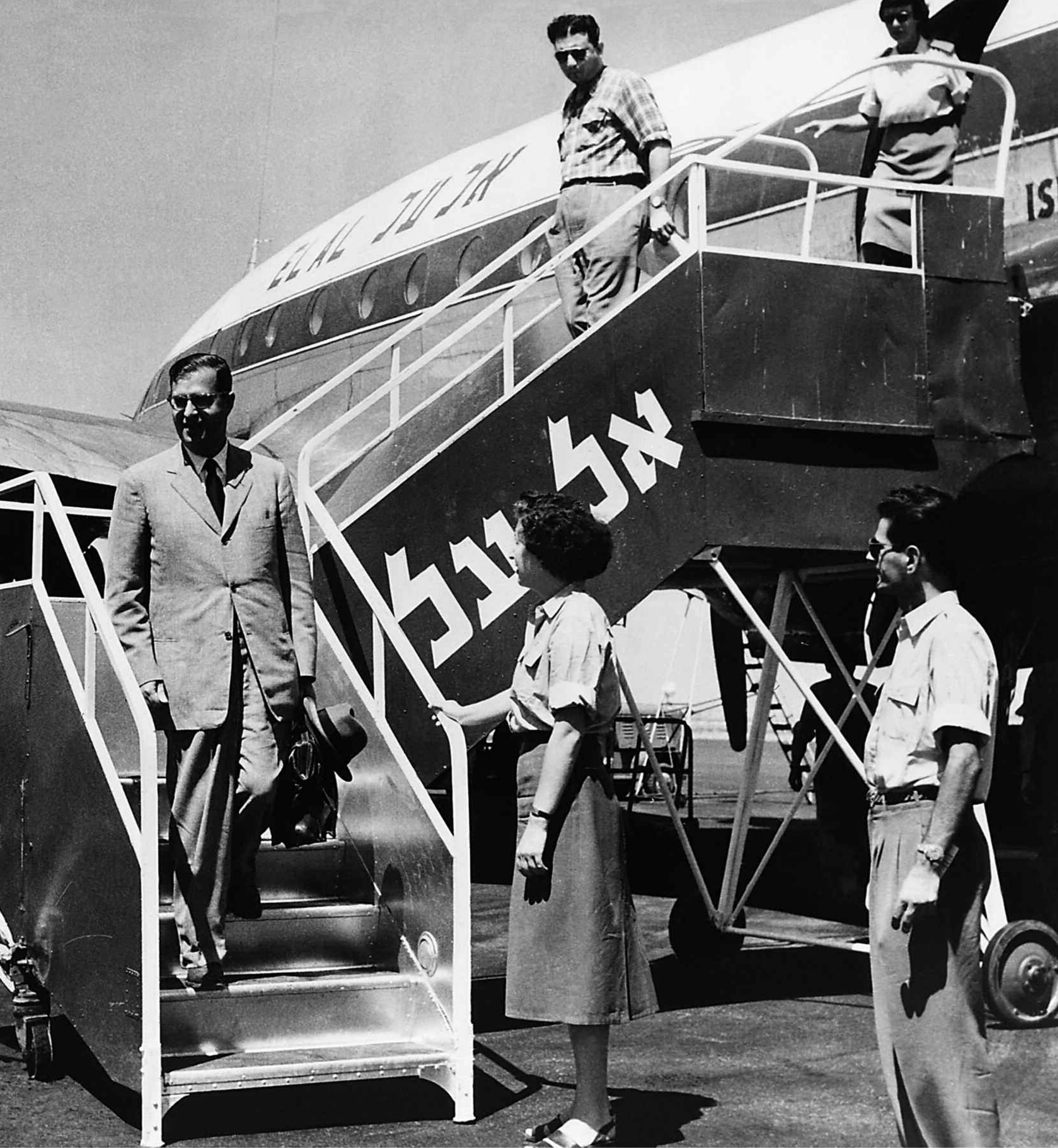
Abba Eban arrives at Idlewild Airport (now JFK) Airport on EL AL in the mid-1950s while serving as Israel's Ambassador to the United States and the United Nations.