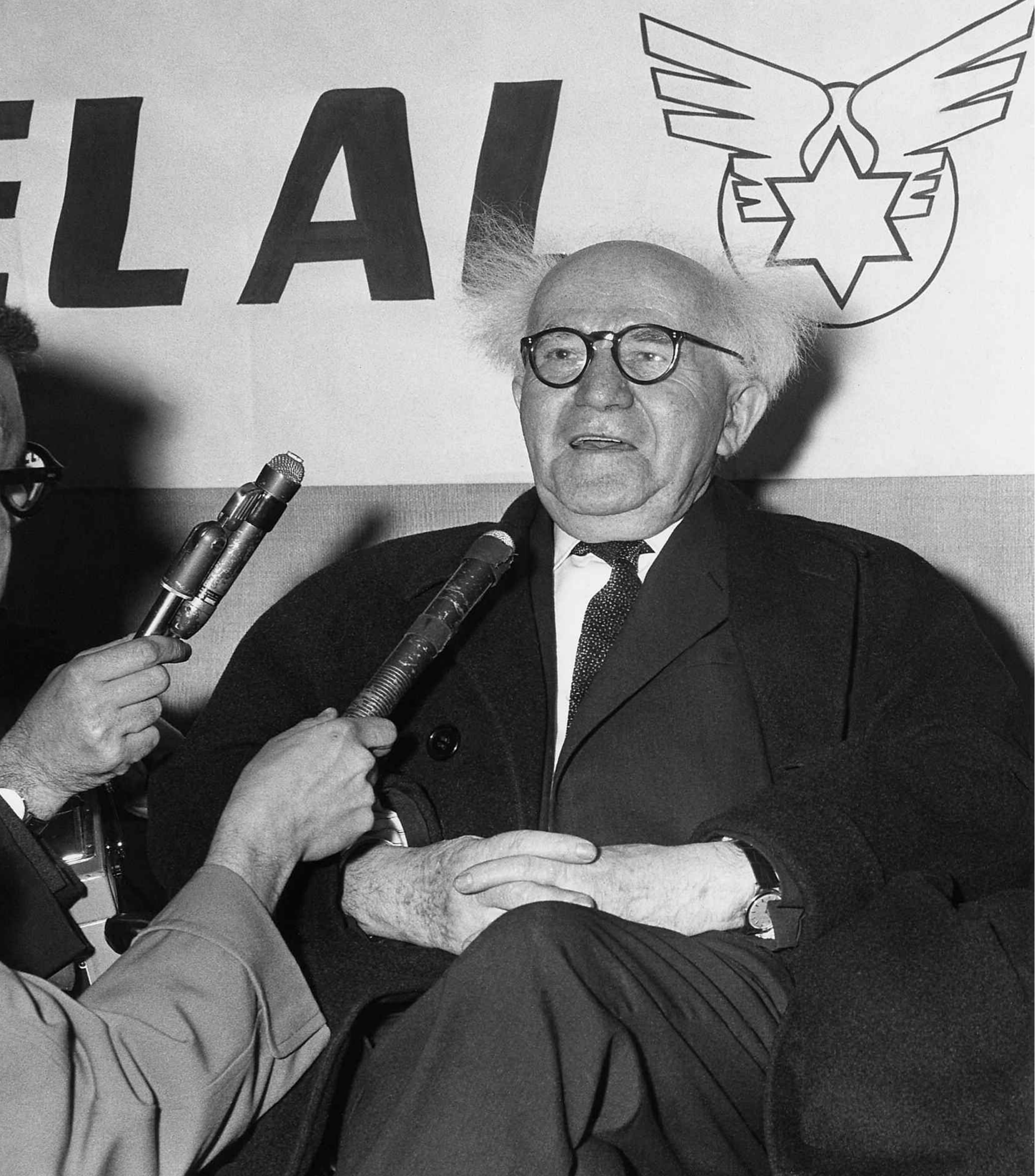
David Ben Gurion, former Prime Minister of Israel and one of EL AL's most frequent travelers, gives an interview in New York following one of his many trips on EL AL, 1960. Ben Gurion Airport (formerly 'Lydda' or 'Lod') is named in his memory.