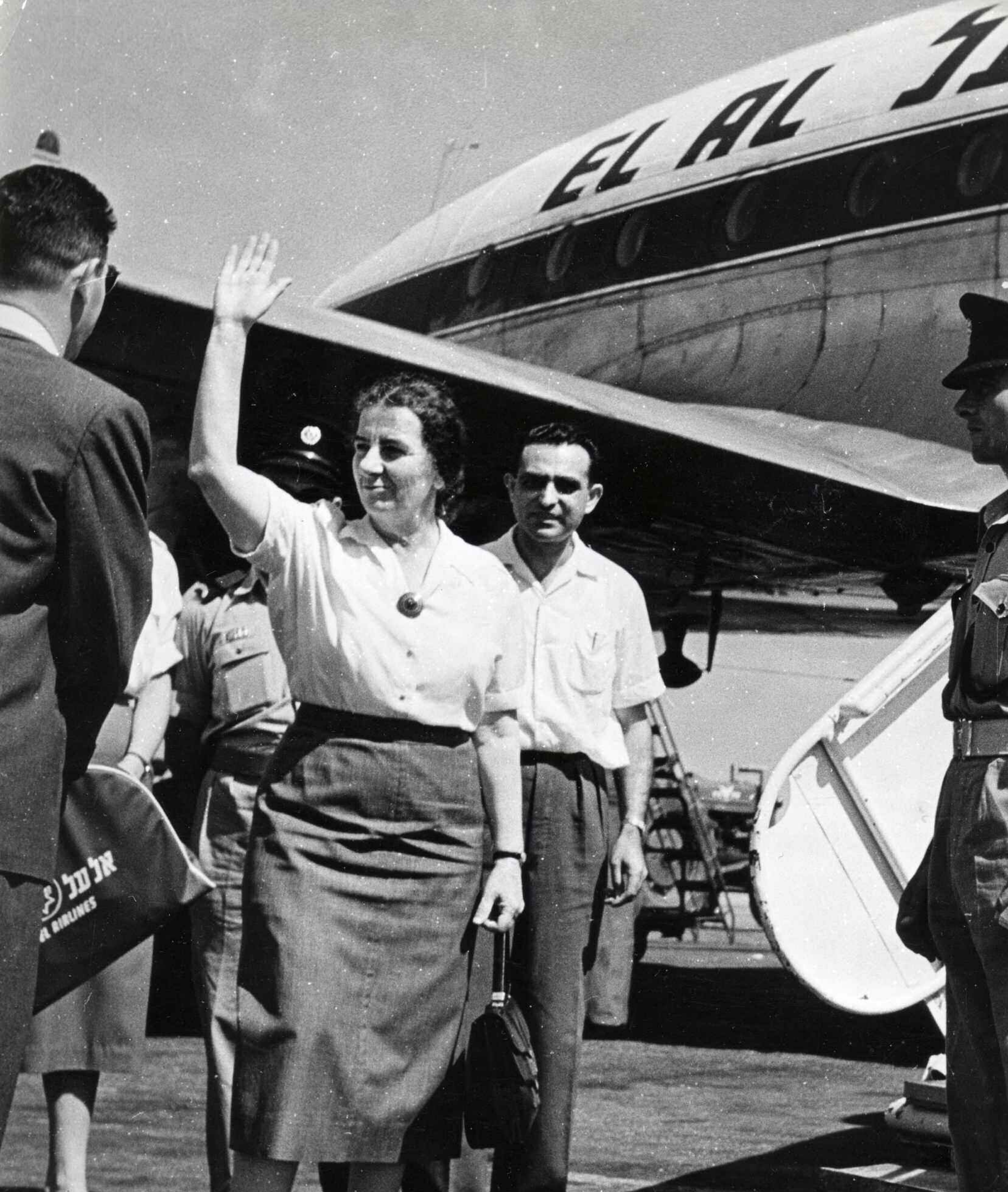
Golda Meir, an Israeli government Minister at the time and later Prime Minister, arrives in New York after flying on an EL AL Constellation aircraft, mid 1950's.