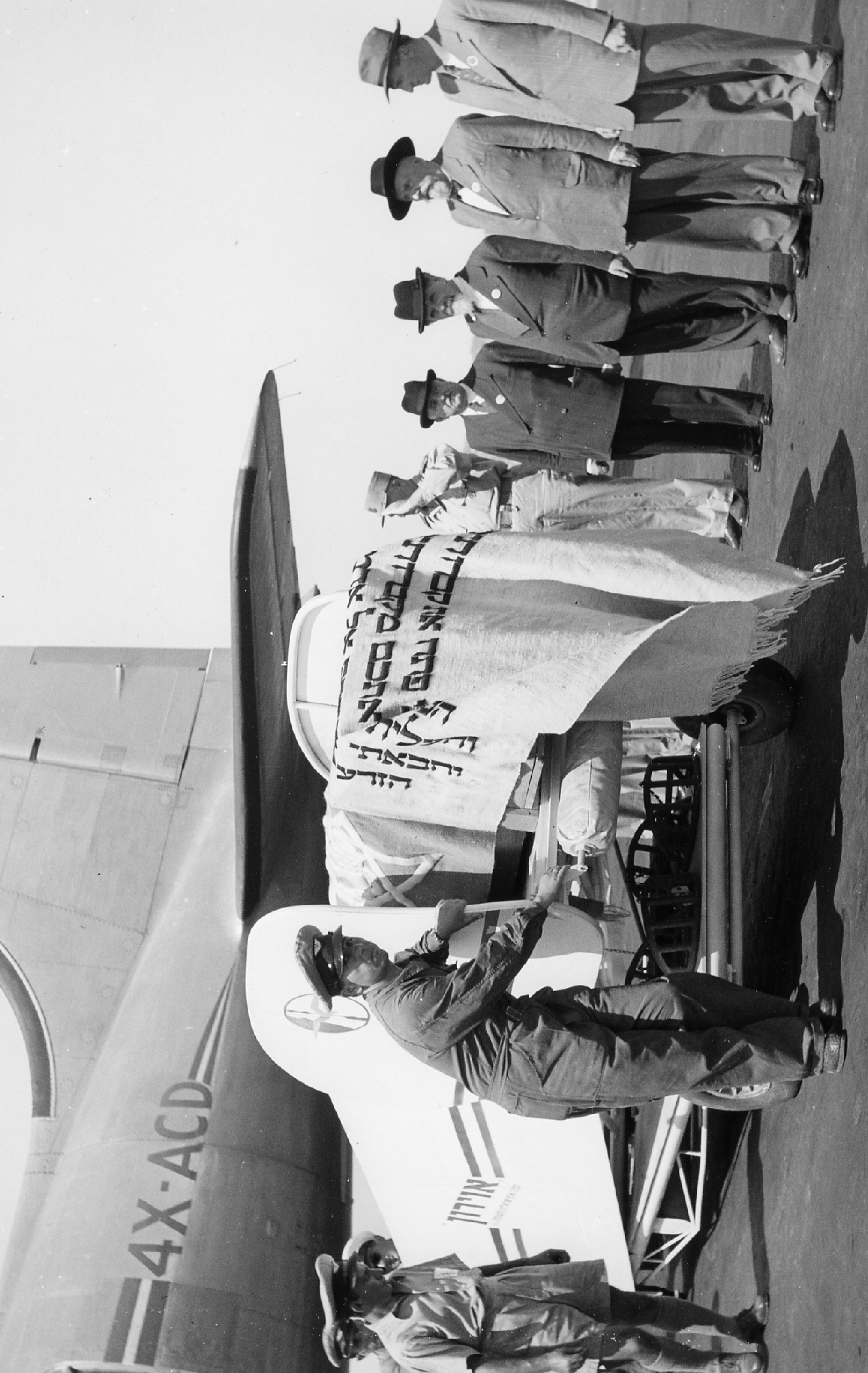
The draped coffin of Theodor Herzl arrives in Tel Aviv at Lod Airport (now Ben Gurion), having been carried to Israel aboard an EL AL special flight from Vienna on August 16, 1949.