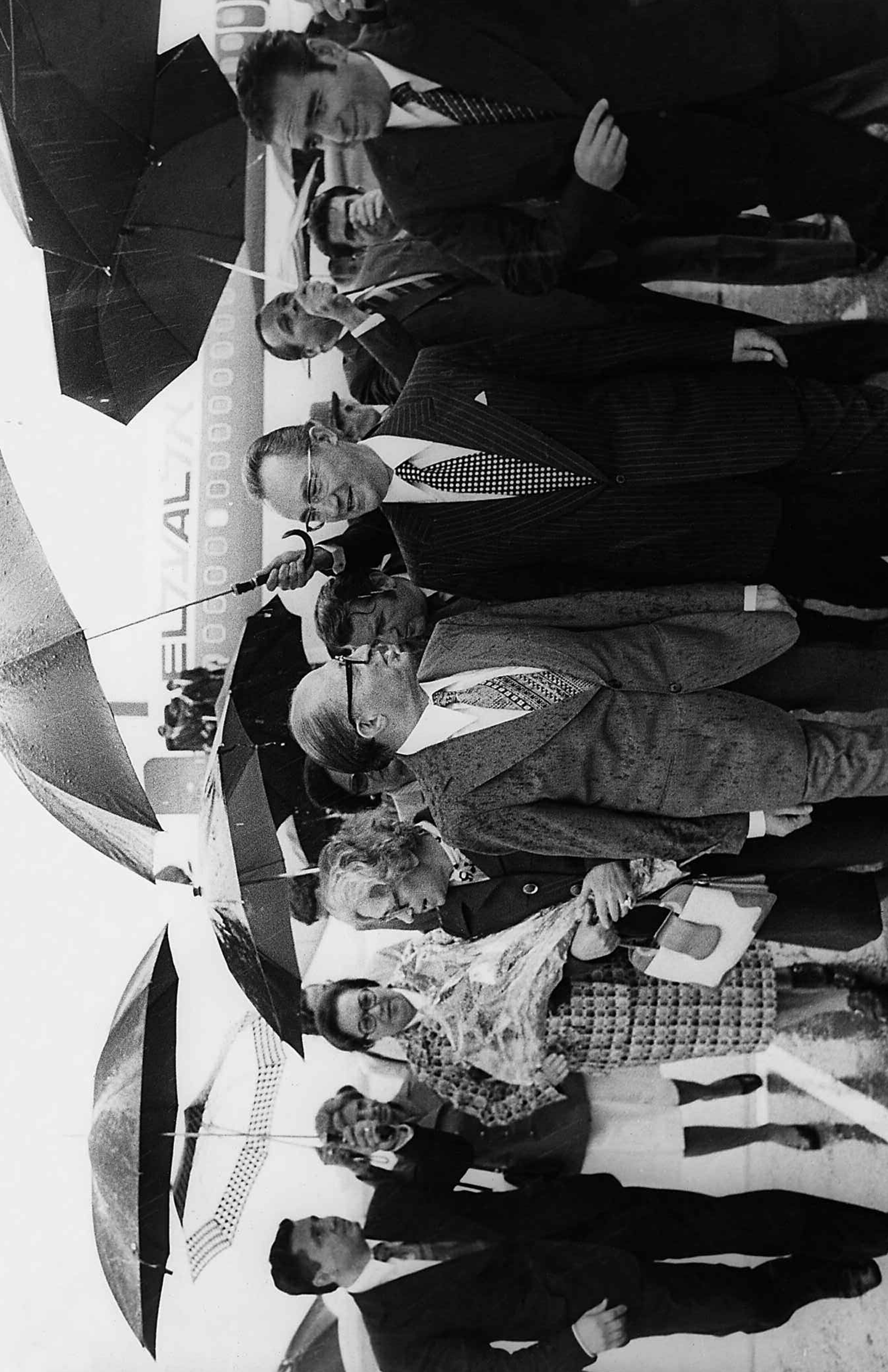
Menachem Begin, Prime Minister of Israel from 1977 to 1983, returning to Ben Gurion Airport from one of his frequent trips abroad on EL AL in the late 1970's. To his left in the photo is wife Aliza.