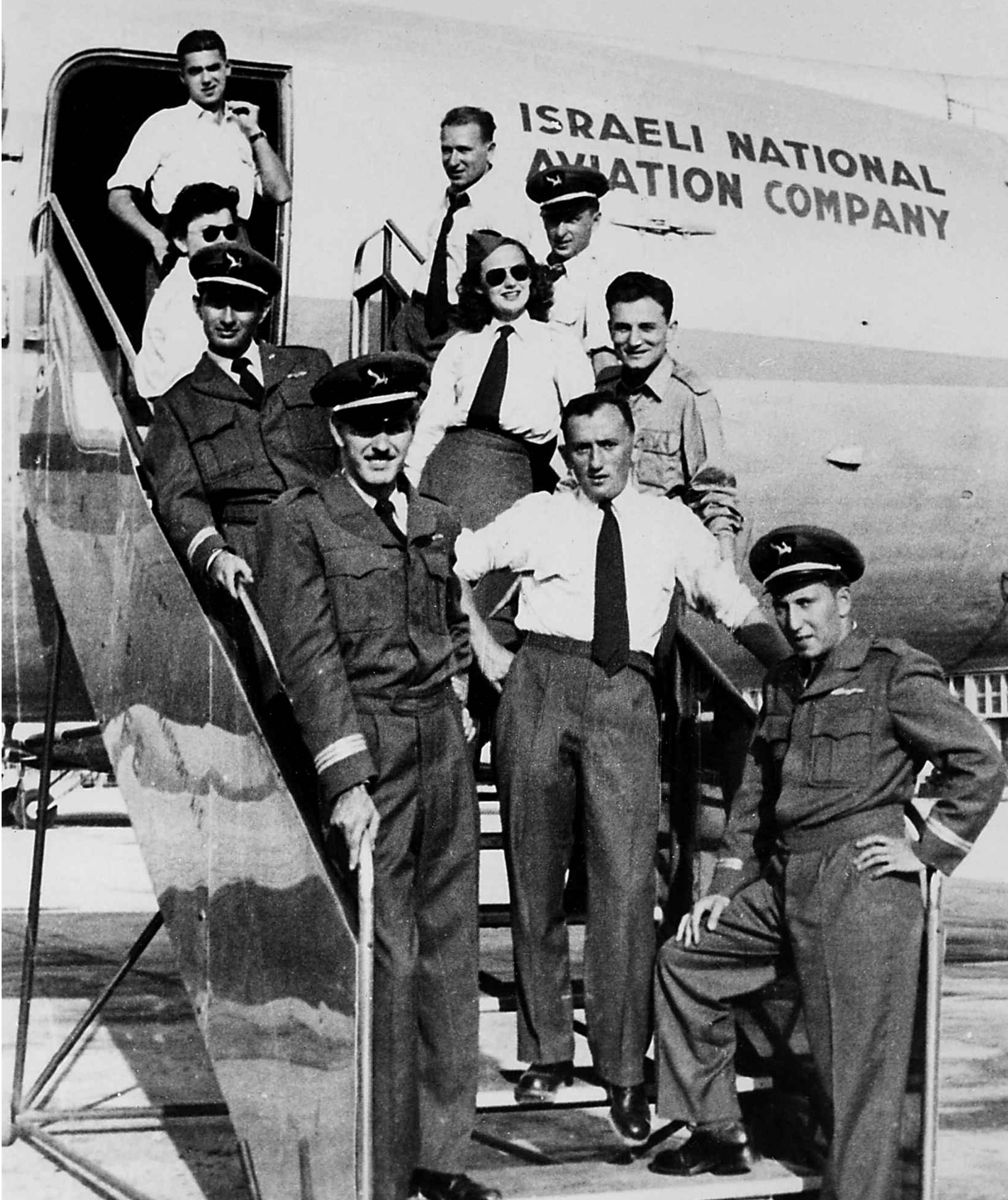
Some crew members on the first flight of EL AL, Israeli National Aviation Company, that brought Chaim Weizmann from Geneva to Israel, to be sworn in as Israel's first President.